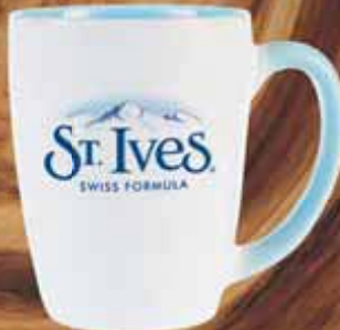
WHITE/LIGHT BLUE 400168WHLB